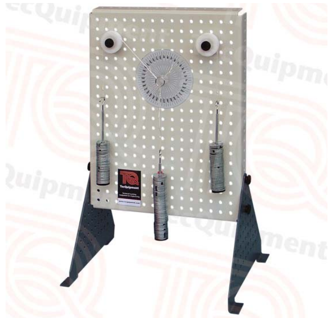
Typical kit shown fitted to Work Panel